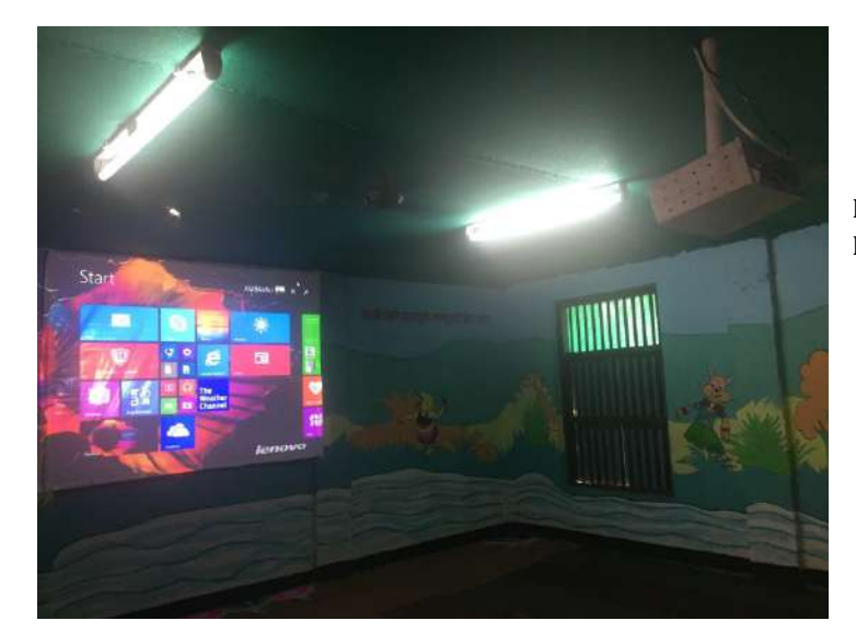
Donation for Digital Class room in Zila Parishad School

Distribution of books to school children